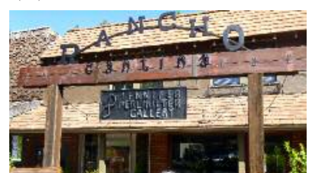
The front patio of Rancho Cantina in Lafayette

The Hideout Kitchen & Cafe: 3400 Mt Diablo Blvd., Lafayette - (925) 900-8861